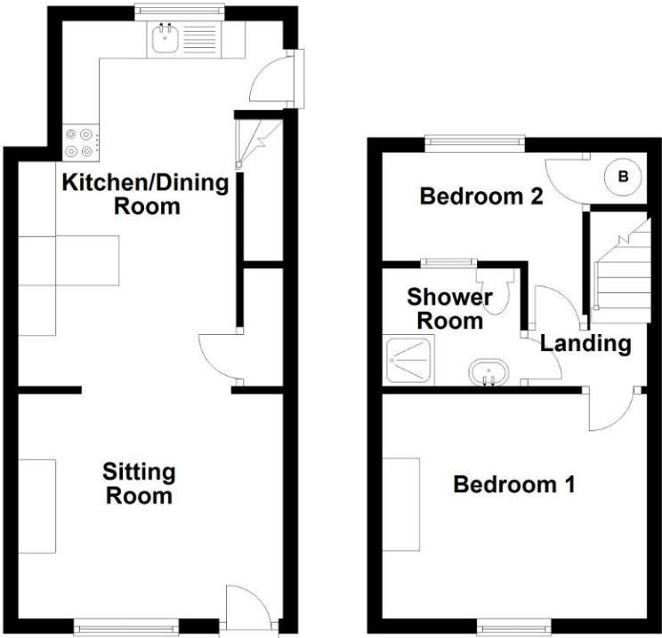
Total area: approx 526.0 sq. feet