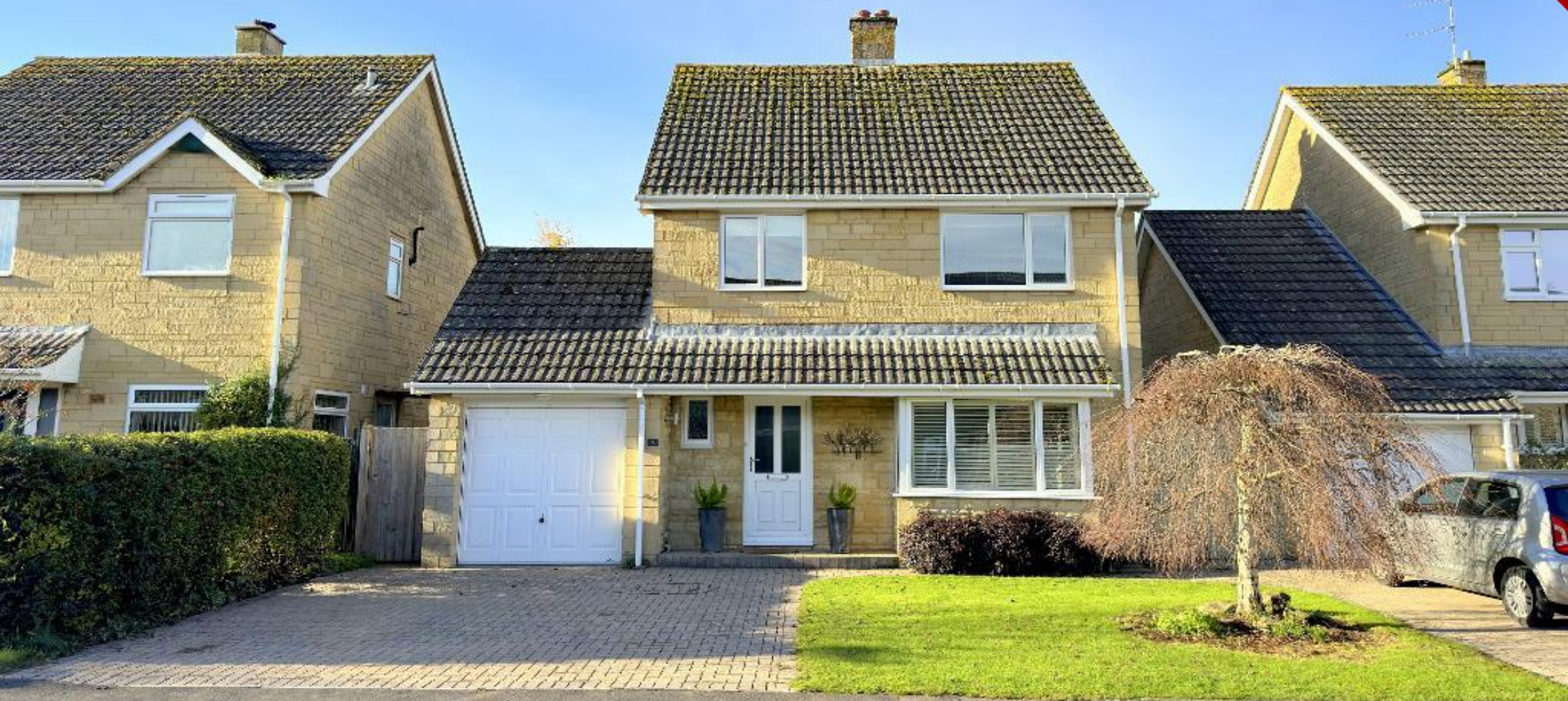
3 BEDROOM DETACHED | FIELDINS, WINSLEY, BA15 | GUIDE PRICE £550,000